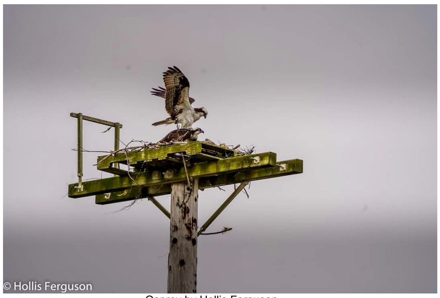
Osprey by Hollis Ferguson

Noxious Weeds and Article for Breeze; Suggested Changes to Fine System; Article for Breeze Regarding Dogs