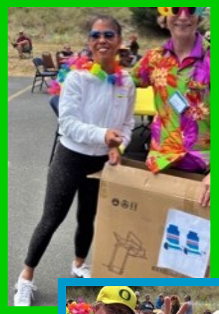
ANITA → SITES