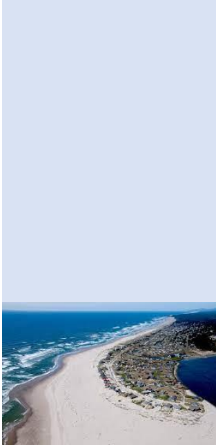
Aerial photo by SRWD